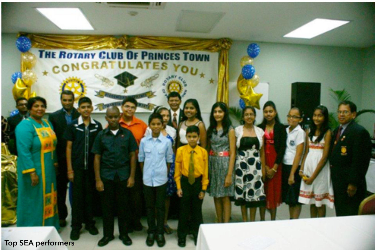
Top SEA performers

sum of $5,000.00 each to assist in defraying some of the costs associated with tertiary level education.