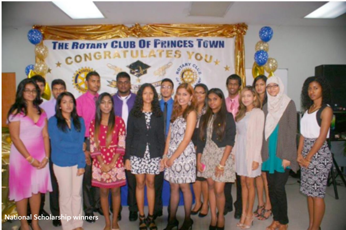
National Scholarship winners